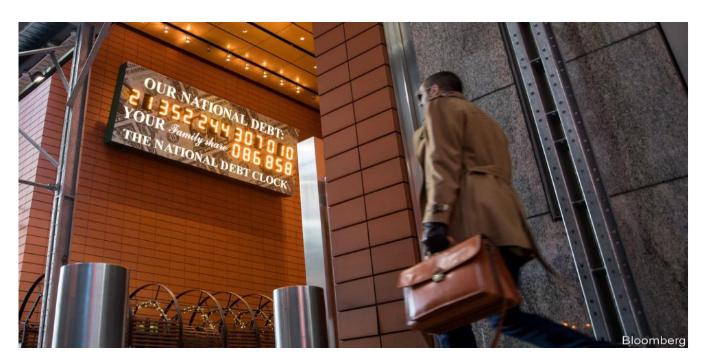
Print edition | Finance and economics

The profession is becoming less debt-averse